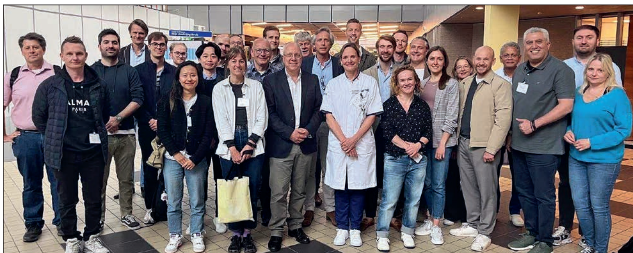
Fig 2 University of Groningen, Netherlands, 2024.