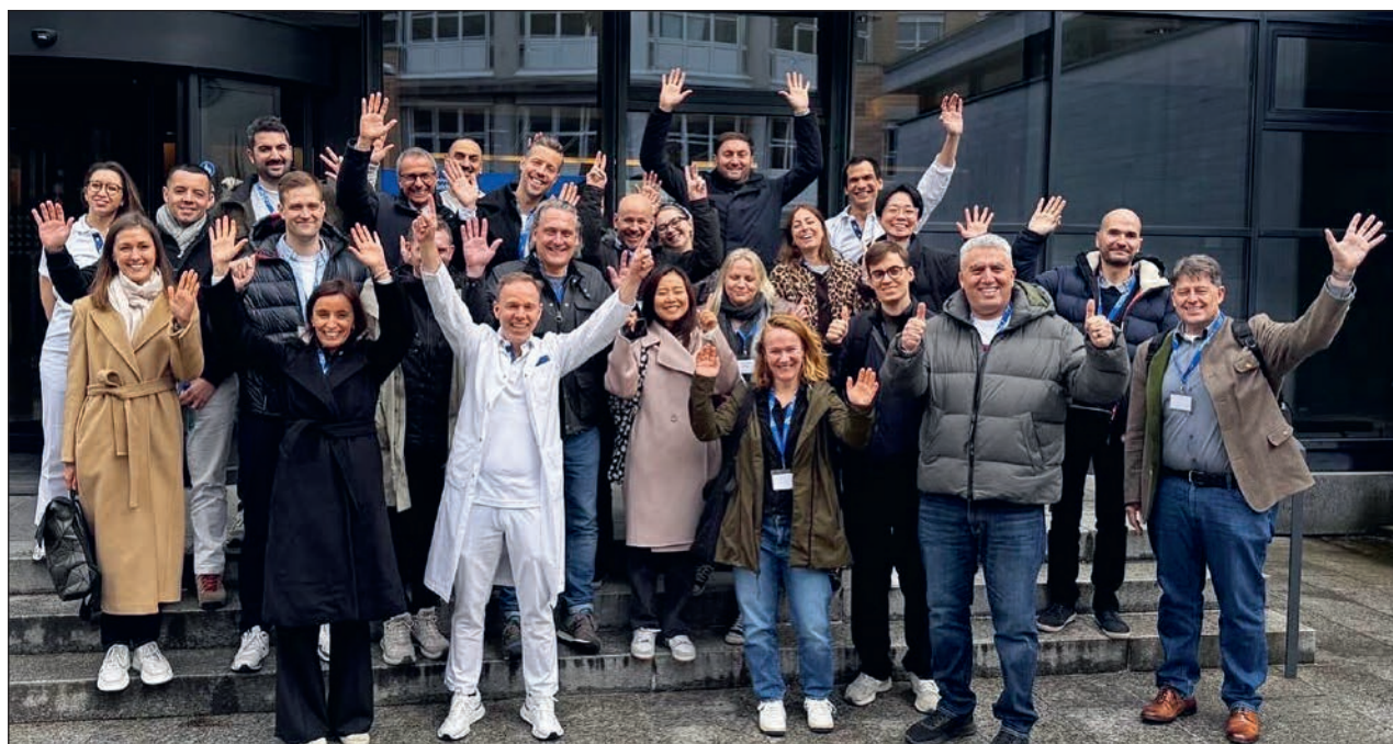
Fig 4 University of Zürich, Switzerland, 2025.

2. What specific expertise does your university offer that would be of interest to the participant?