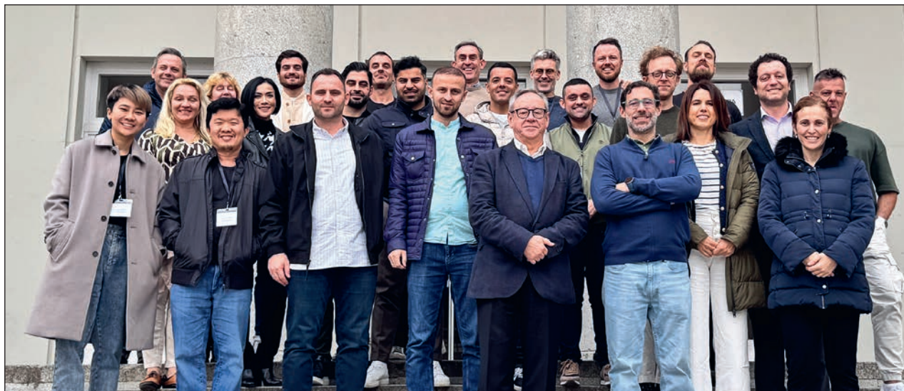
Fig 5 University of Complutense, Spain, 2024.