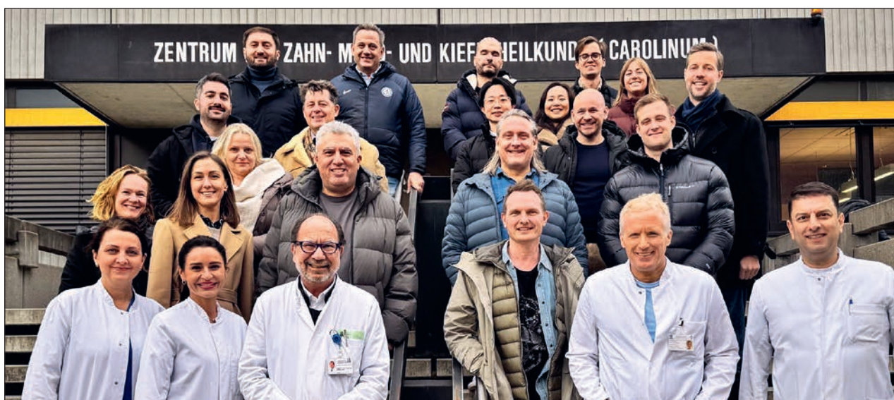
Fig 3 Goethe University, Germany, 2024.