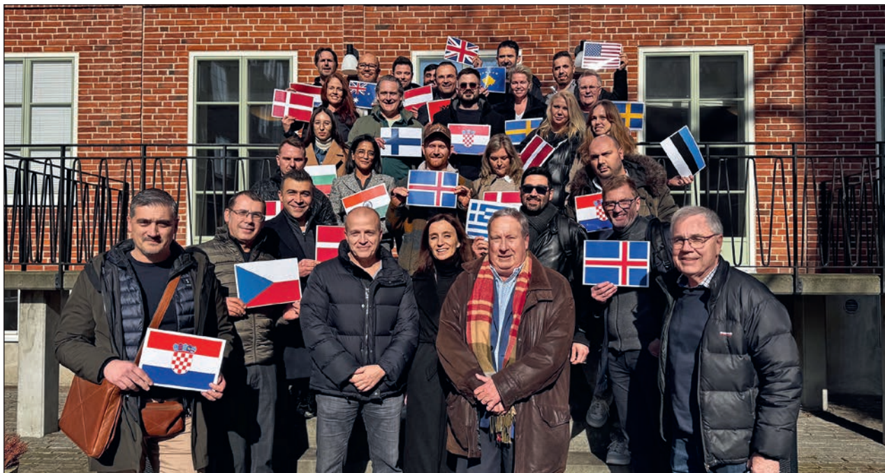
Fig 1 University of Malmö, Sweden, 2025.

prestigious universities. The multicenter approach ensures updated and current teachings from world famous experts in each respective field. All course leaders are experienced clinicians as well as internationally renowned lecturers with extensive research experience and impact.