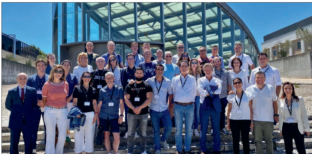
Fig 6 University of Lisbon, Portugal, 2022.